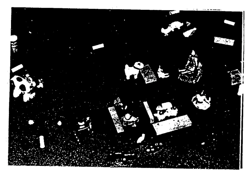
FIG. 8. Plaashuis en werf. Oupa en Ouma in een vertrek. Pappa en Mamma met 'n dogtertjie voor hulle. Buite op die werf twee kinders by 'n koei.